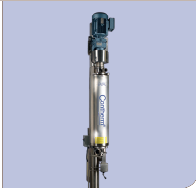
Contherm SSHE model 6x6

Product enters the cylinder through the lower product head and flows upwards through the cylinder. At the same time, the heating/cooling media travels in counter-current flow through the narrow annular channel between the heat transfer wall and the insulated jacket.