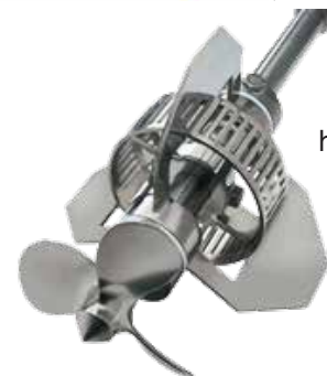
ROTOSTAT® head for XP-02

When reducing the particle size of certain materials such as fruit chunks, candy pieces, or nuts for example, the XP-02 is a suitable option. The XP-02 comes with our patented Rotostat® rotor-stator impeller and optional lower propeller.