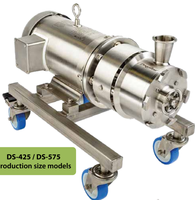
DS-425 / DS-575 production size models

The Dynashear represents the latest technology for sanitary inline continuous processing, or batch processing with recirculation. The Dynashear will blend, dissolve, deagglomerate, disperse, and emulsify a wide range of fluids and semifluids, and is particularly effective for wetting out powders into a liquid. It features a first-in-class tandem head design combining the benefits of both an axial and a radial stage, creating excellent shear and flow characteristics. The result is droplet size reduction as low as 2 - 3 microns and a very narrow distribution, plus flow capacities that are substantially higher than existing inline mixers.