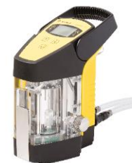
Portable CO 2 / O 2 measurement