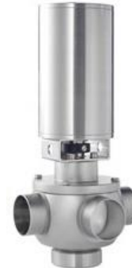
Arc & Ball Valves