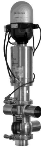
365it PMO Mix Proof Valves