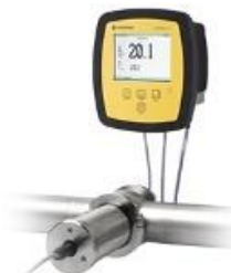
In-line CO 2 / O 2 Measurement