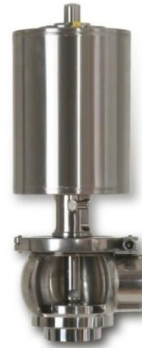
Single Seat & Double Seat Valves